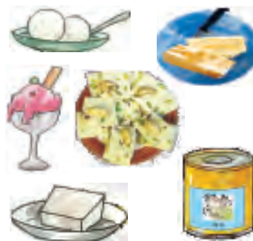
Things made of milk