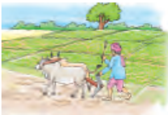
Ox ploughing field