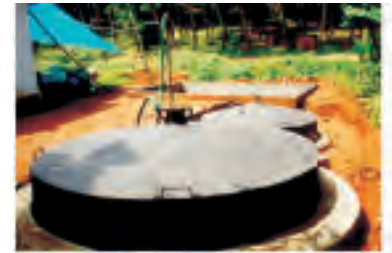
Gobar Gas Plant