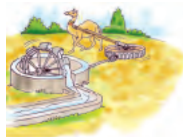
Camel pulling Persian wheel

Horse, camel and elephant are used to ride and move from one place to another.